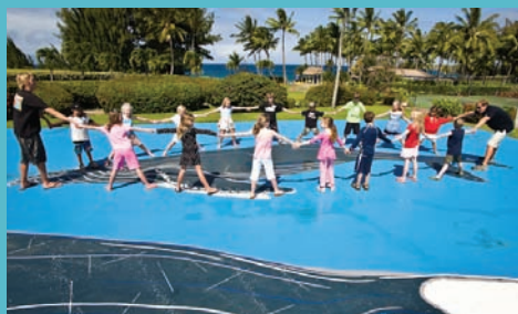
Children participating in the Ambassadors of the Environment /Whale Quest Kapalua program learn about whales.

The annual event benefits a number of local research organizations including Whale Trust, Center for Whale Studies, and Hawaii Whale Research Foundation, the Dolphin Institute, Hawaii Marine Mammal Consortium, and the Marine Mammal Institute at Oregon State University.