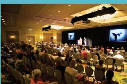
Attendees at one of the live presentations, with incredible film footage and fascinating information presented by world-renown researchers.

artists and non-profits from around the world, a free educational program for Maui's schools, daily whale watches, and interactive educational activities for over 200 children led by Jean Michel Cousteau's Ambassadors of the Environment program.